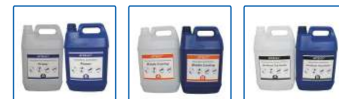
MTB-3327 Epoxy Primer MTB-3328 Epoxy Middle Coat MTB-3329 Epoxy Top Coat