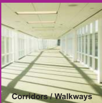
Corridors / Walkways